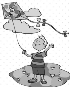
flying a kite