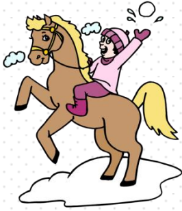
riding a horse