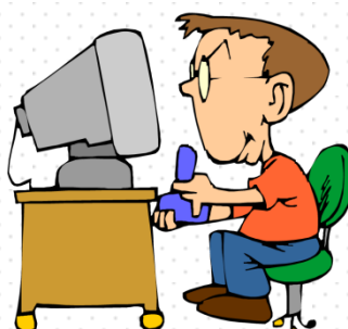
playing pc games