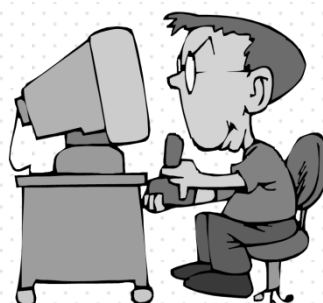
playing pc games