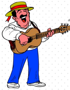
playing the guitar