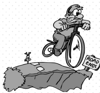
riding a bike