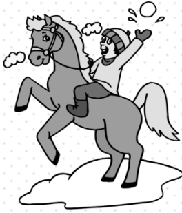
riding a horse