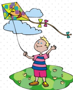
flying a kite