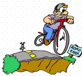
riding a bike