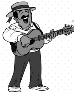
playing the guitar