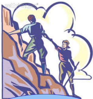
hiking or rock climbing