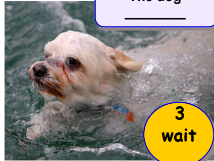
The dog _____