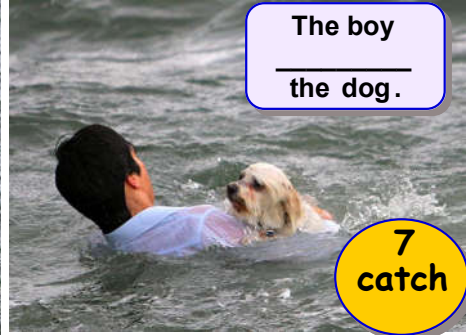
The boy _____ the dog .