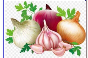
onion garlic shallot