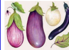
eggplant / aubergine