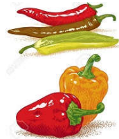
hot pepper / sweet pepper