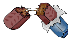
A CHOCOLATE BAR