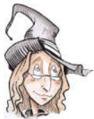
Agnès Pihuit my-teacher.fr