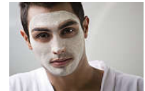
an oval face