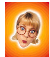
a pointed face