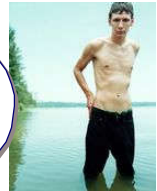
thin = skinny