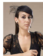
a pale complexion