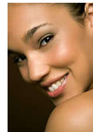
a dark complexion