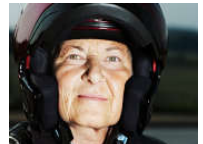
a square face