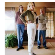
of medium height