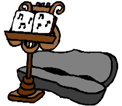
7) music room