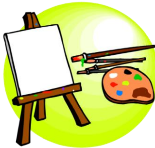
10) art room