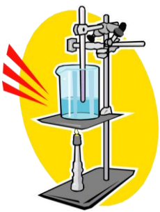
8) science room