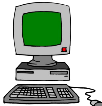
14) computer lab