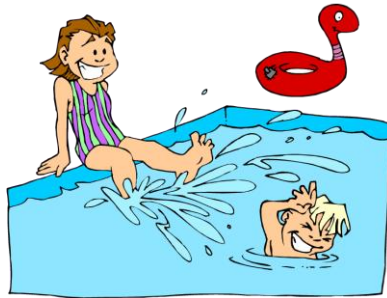
6) swimming pool