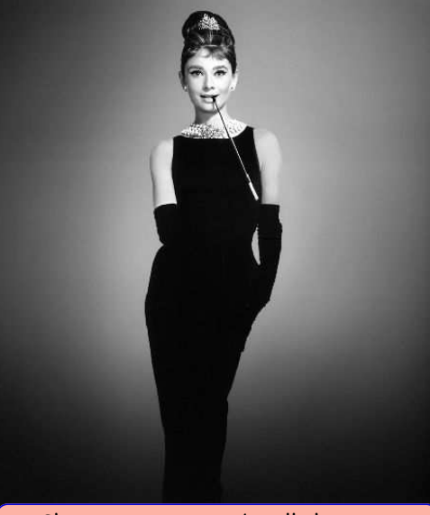
She _____by all the young women of her generation.(copy)