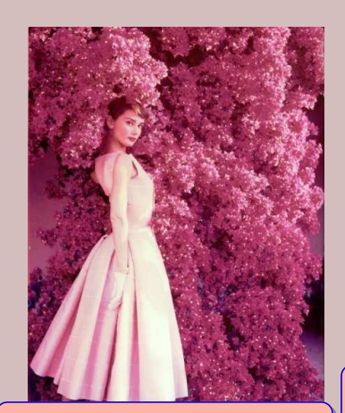
favourite model by Givenchy in 1954.(select)