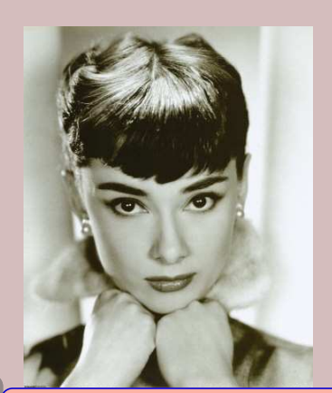
She all sorts of parties, where she attracted everybody's attention. (invite)